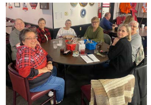
Staff and volunteers gathered at Post 500 to be honored for their contributions. Fun and fellowship were enjoyed by all!

Let's hear how you're ringing bells across the Department. If you have a photo or event you would like featured, please reach out to HANeditor@ameritech.net .