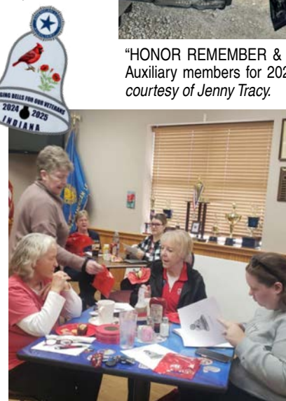
History workshop in Newburgh Unit 44.