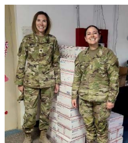
Carmel Cares: Carmel Post 155 members sent care packages to Camp Arifjan and some of its out stations. Soldiers gratefully picked up boxes at the Task Force Spartan Chaplain office.