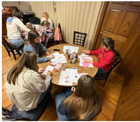
District 8 Juniors are collecting funds to help with supplies for Creative Arts through a March fundraiser. If you are interested in sponsoring a day in March (example: March 10th = $10 for Creative Arts) please reach out to the 8th District Juniors.