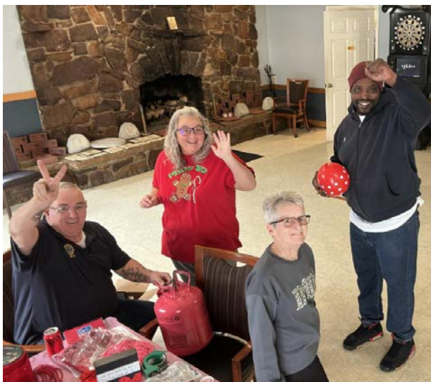
Members of American Legion 492 and its Auxiliary spread the love by hosting a Valentine's Day Dinner.