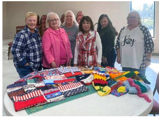
Auxiliary Unit 204 Sewing Circle ladies are creating something special. Beyond quilts, they're crafting pillow cases for veterans in nearby nursing homes and those transitioning to permanent housing, as well as fidget blankets for memory care patients at the VA Hospital and local nursing homes.