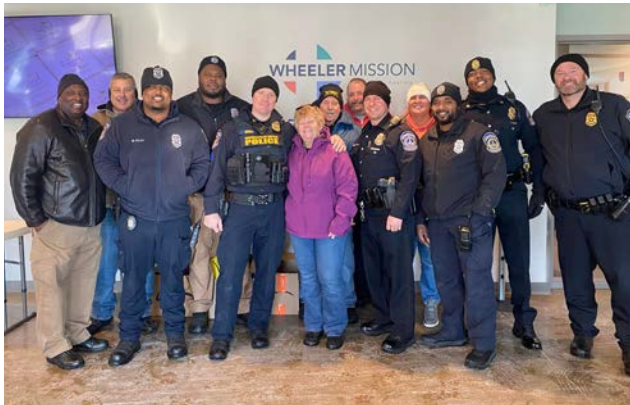
Speedway Post 500 Auxiliary made care packages in support of homeless outreach. IMPD joined Legion family members as they distributed their care packages in downtown Indianapolis.