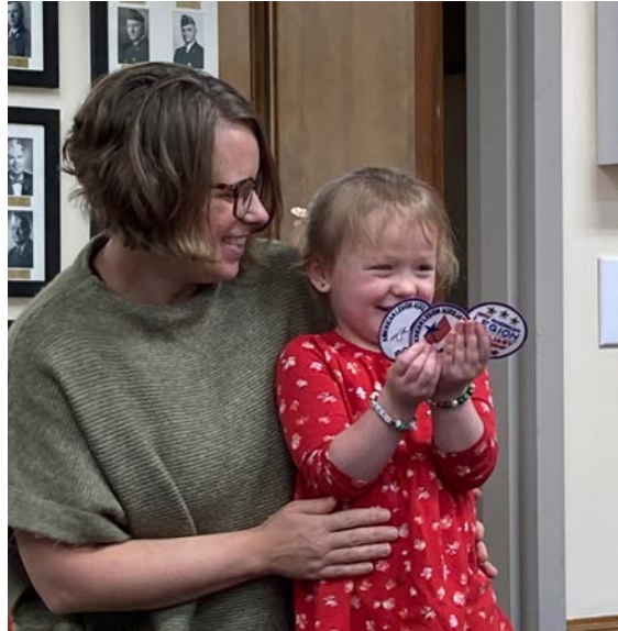
INDIANA'S OWN LITTLE LEADING LADY: The first Junior in the nation to earn ALL patches in the new Purple Level (ages 3-K) for the Junior Patch Program.