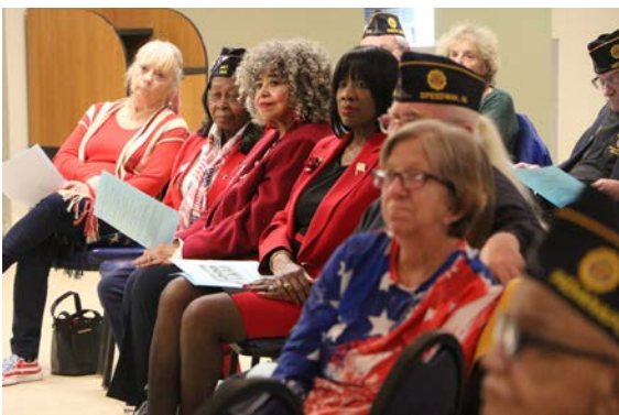
FOUR CHAPLAINS: The story of the four chaplains had the 11th district audience spellbound.