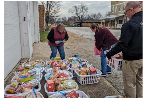
ALA MEMBERS' AWARD-WINNING PRODUCTIONS: Units across the state are putting on a show! Featured here is ALA Unit 141 and their community gift-basket donation.