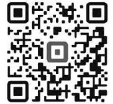
Children & Youth Fund Raiser Store

You can make a cash donation at Spring Conference, or they can be sent directly to the Department office with "Camp Carson" in the memo line. You can purchase a t-shirt using the attached form, or online at https://childrenandyouth-101661.square.site . Here is a QR code your members can scan to take you directly to the site, which also allows online donations. Please display this at your meetings for those interested.