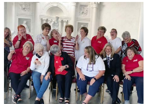
BEST COMEDY: The ladies of the 7th District share award-winning fun!