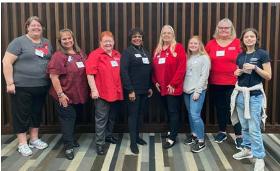
INDIANA MEMBERS GO ON THE ROAD: The Mission Training held in Nashville, Tennessee received great reviews!