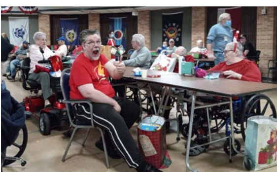
CHRISTMAS ON THE HILL: The Indiana Veterans' Home Christmas party was a heart-warming feature.